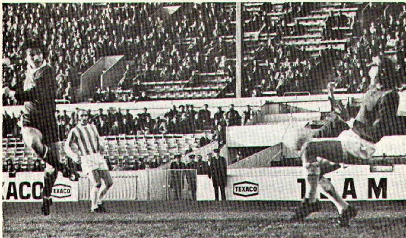
These two photographs show Swindon's international centre-forward in action. In the top one Treacy gets in a close-range effort, only to see Pierce, the Huddersfield goalkeeper, make a superb save. In the lower photo Treacy takes the penalty which lead to the controversial sending-off of Pierce.